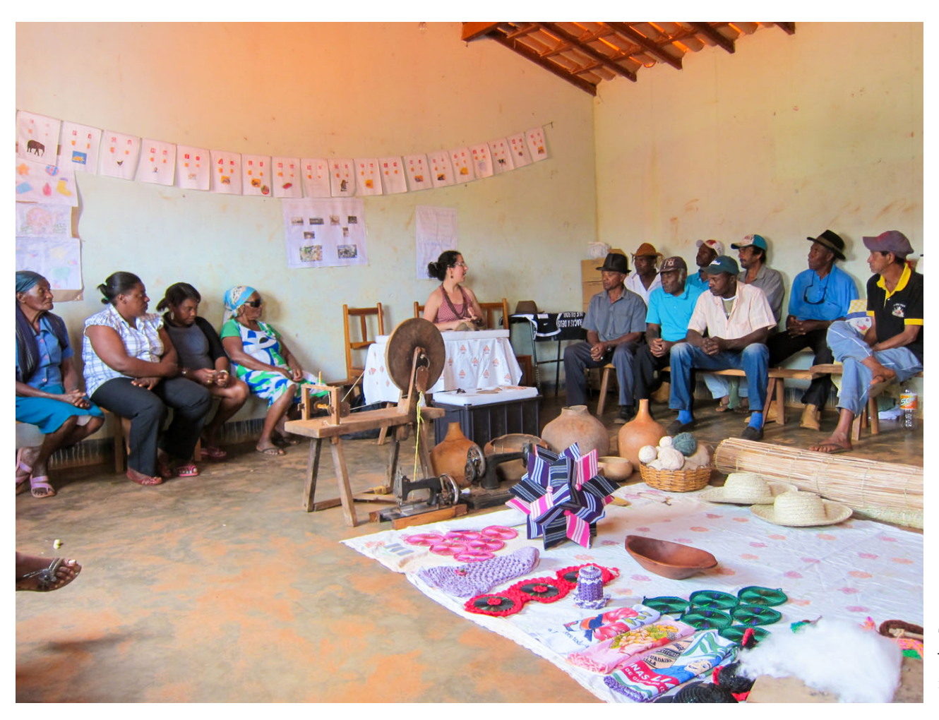
Quilombo community of Pau Ferro do Joazeiro: one of the Museum of the Alto Sertão of Bahia centres

In addition to this museum, other musealisation initiatives by indigenous groups underline the power of the Kanindé people's memory after being defined as 'missing' by the state under the 1850 Land Act. For the state of Ceará, whose historiography 'was born under the sign of the negation of the indigenous presence' (ibid., p. 29), these museums provide important bases for the process of ethnic emergence.<sup>5</sup>