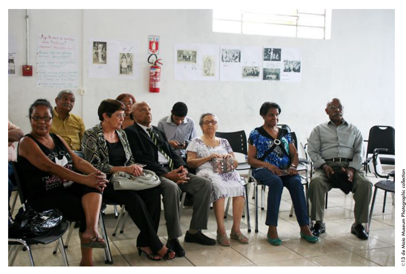
Treze de Maio Museum memory circle, 2010